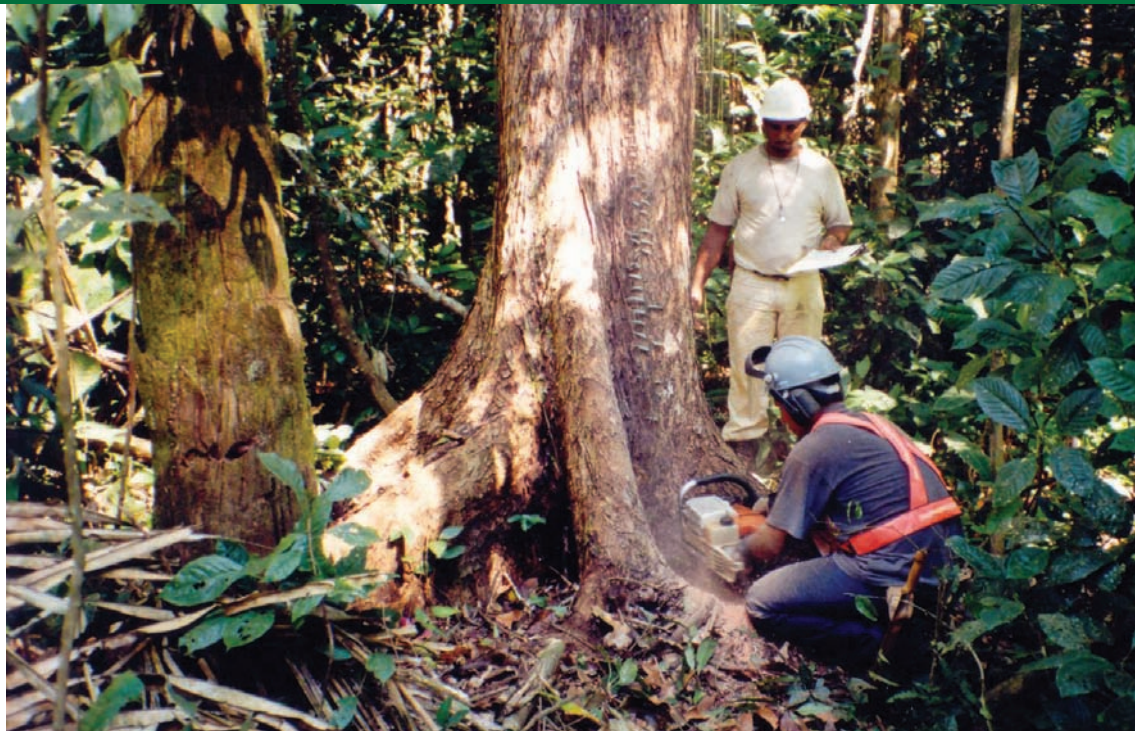
Timber: Reduced impact logging of mahogany at Acre field site.

4 Middlebury College, Middlebury, VT, USA (rlandis@middlebury.edu)